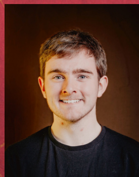
King Cactus Sam Press